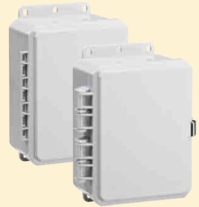
EZ or Low Profile Hinges

Standard packaging is one unit per carton, packed to ensure safe delivery to your location. Or, if you have any special requirements for shipping, call us and we can work to meet your requirements.