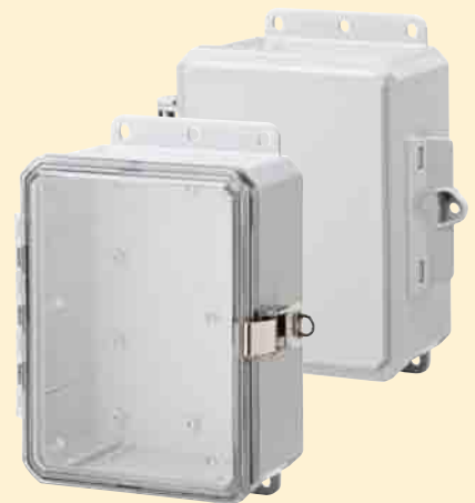
Clear Cover. Stainless Steel & Integrated Locking Latch