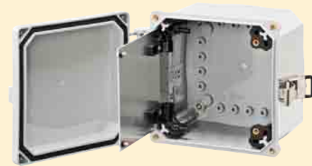
Swing Out Panel